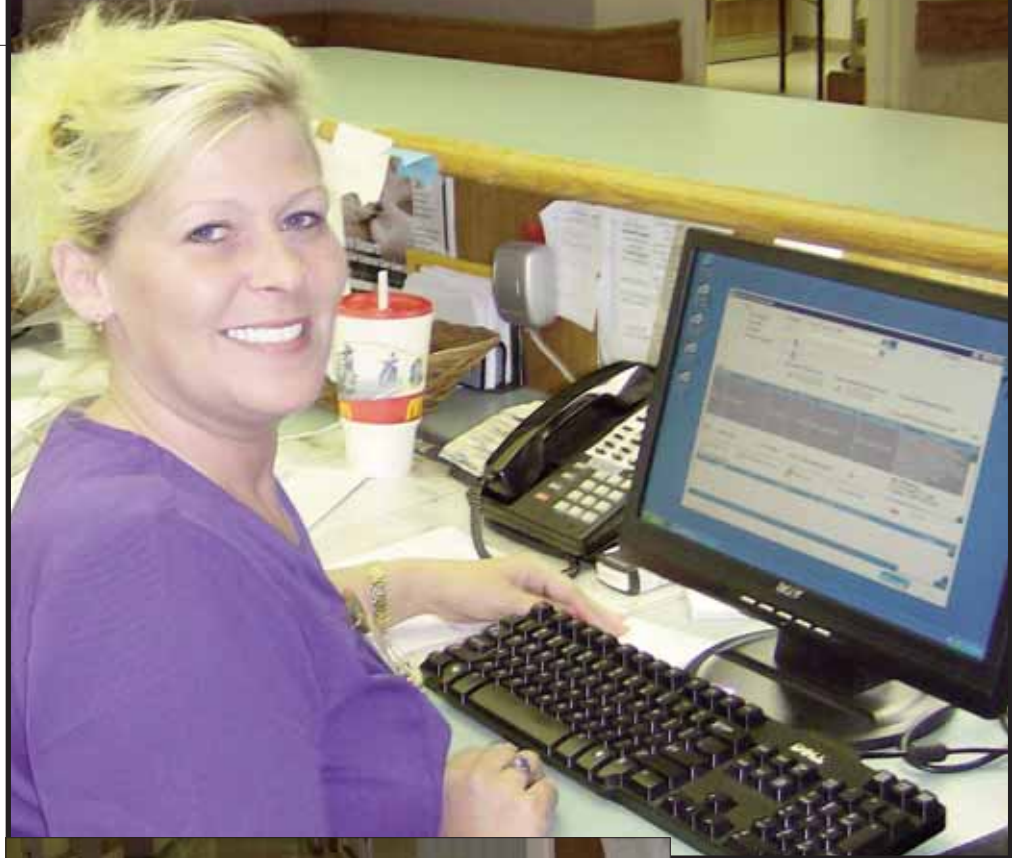
Happy nurses at work using Eidetik software !

"I have been constantly impressed with the evolution of WEBDEV and the fact that the product continues to lead the pack when it comes to including bleeding-edge technologies such as the latest Web 2.0 features. The ever-